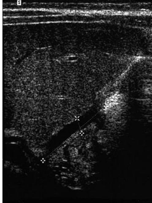
Fig 1. Gall bladder of an infant with biliary atresia