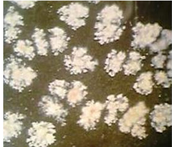
Figure 1. Appearances of the breast milk stem/progenitor cells 14 days after incubation in a 12-well plate with an 18-mm diameter and containing 1000 \mu l Methocult H 4435 medium [The numbers of colonies were assigned with inverted microscope [original magnification 40 \times ]]

Interestingly, our data demonstrated the significant increase in breast milk CFE of mothers with infants' weight of 3,000-4,000 g on day 5 ( 130 \pm 62 ; P=0.03 ) and day 15 ( 105 \pm 26 ; P=0.021 ) after delivery. Furthermore, the CFE on day 15 after delivery in the 25 to 35-year-old mothers was significantly lower than that in 35 to 45-year-old mothers ( P=0.01 ).