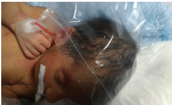
Figure 1. Premature neonate with polyethylene head cap

Immediately after birth and cutting the umbilical cord in the delivery room, the newborns of the first intervention group were placed under