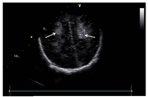
Figure 1. Transcranial ultrasound showing grade I hemorrhage and ventricular wall hyperechoic lesions consistent with hemorrhage [arrows]