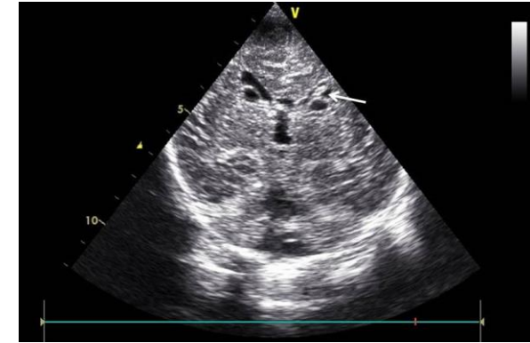
Figure 2. Transcranial ultrasound showing grade II intraventricular hemorrhage [arrows] (Note normal sized ventricles)