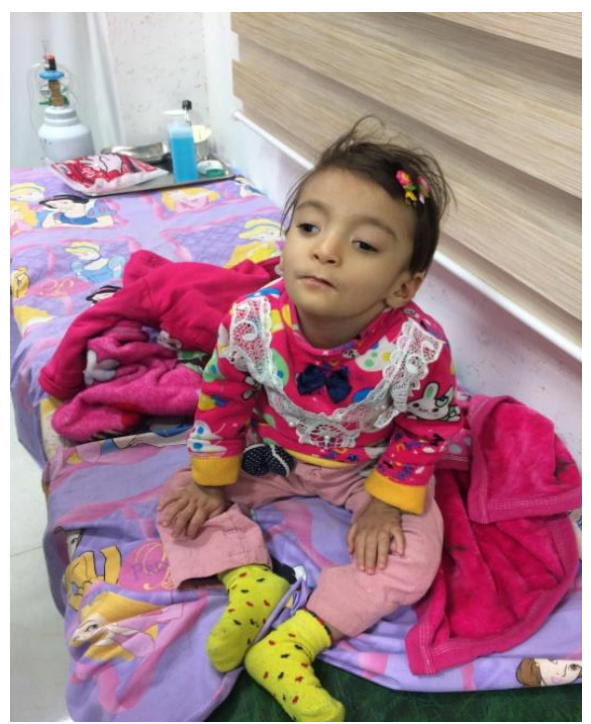
Figure 1. Moderate ptosis affected both eyes

ptosis affected both eyes and depression of deep tendon reflexes in lower extremities although electromyography and nerve conduction velocity tests showed normal results (Figure 1). Further history taking revealed a significant hearing loss (50 db) due to delay in verbal skills and developmental delay.