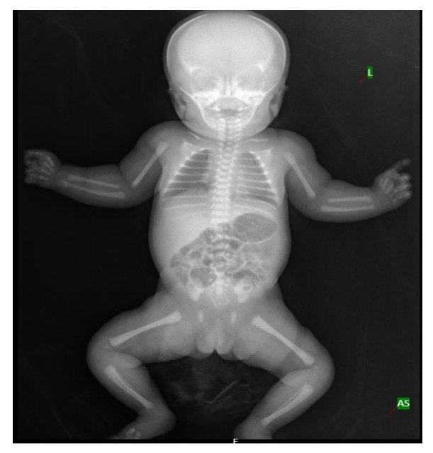
Figure 3. Infantogram of the neonate showing hypoplasia of bilateral clavicles

hypertelorism, and short limbs. X-ray findings revealed the hypoplasia of both clavicles with a bell-shaped thorax (Figure 3). Based on the positive family history, coupled with pathognomonic clinical and radiologic findings, the patient was diagnosed with CCD. The neonate remained asymptomatic during the hospital stay with no feeding or respiratory difficulty, and her parents were offered genetic counselling regarding the regular follow-up of the child.