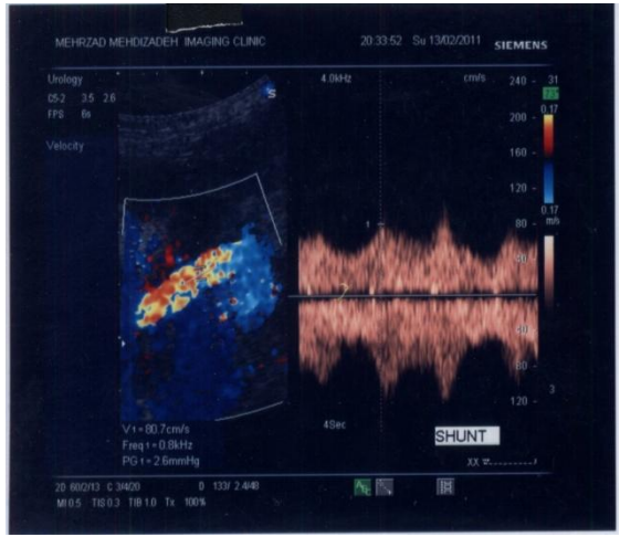
Fig 1: Color doppler of a portal venous thrombus in a case with 2.5 years old.

Among 40 children were studied, portal vein thrombosis were detected by radiologist color doppler ultrasound. Signs and symptoms of portal hypertension were observed in two children (1 girl, 1 boy) with age 2.5 and 1.5 years respectively (fig 1).