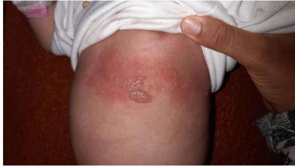
Figure 1. Vesiculobullous rash on T5-6 dermatomes