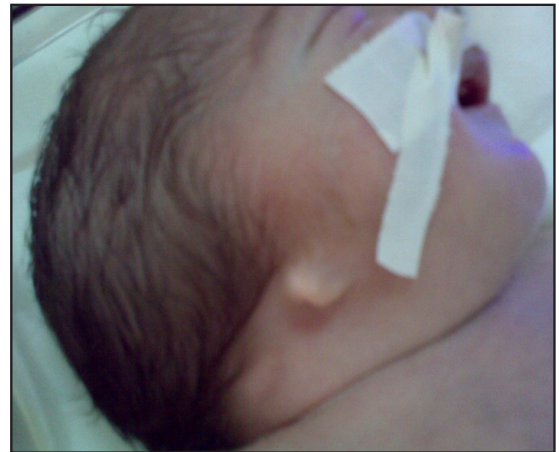
Figure -4. photograph of the patient reveal auricle atresia.