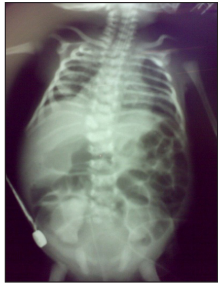
Figure -2. Abdominal x-ray of patient reveal distended abdomen without gas in rectal area because of anal atresia.