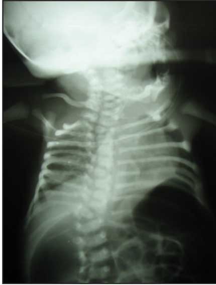
Figure -1. Chest x-ray of patient reveals vertebral anomaly, looped OG tube at the upper pouch of esophagus, gaseous distension due to tracheoesophageal fistula.