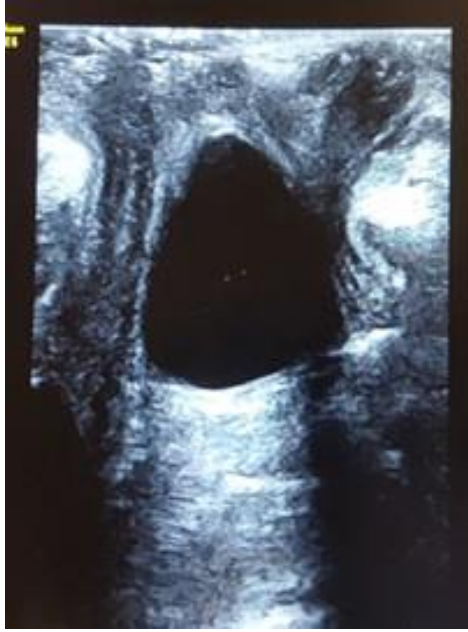
Figure 2. Perineal ultrasound, Cystic mass just near the urethra

We did an ultrasound examination using a high-frequency linear array transducer (12-5 MHz). Trans-perineal ultrasound showed a 14-mm cystic lesion without any solid component located posterior to the urethra and inferior to the vagina (Figure 2).