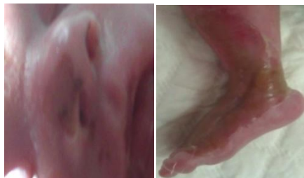
Figure 1. Two skin lesions (Aplasia cutis congenita) with sharp borders on the right side of the nasal blade and distal portion of the right foot. Image of right hand skin lesion had poor quality and is not shown here.

right side of the nose and the distal portion of right hand and foot were observed.