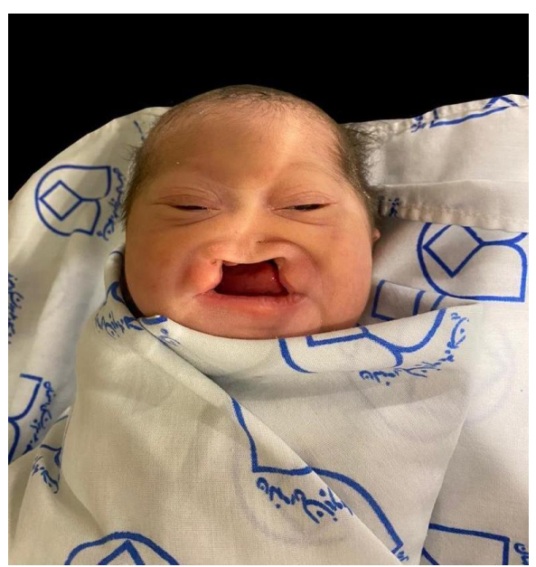
Figure 2. Newborn Infant with Congenital Anomalies (Median Cleft Lip and Palate, Arrhinia, etc.)

including a median cleft lip and palate, arrhinia, head molding, sloping forehead, unilateral cryptorchidism, micropenis, and hypotelorism (Figure 2).